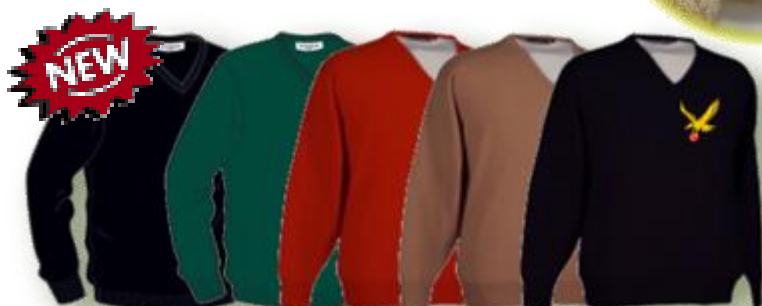
GLENMUIR 1891 Classic Lambswool Sweater