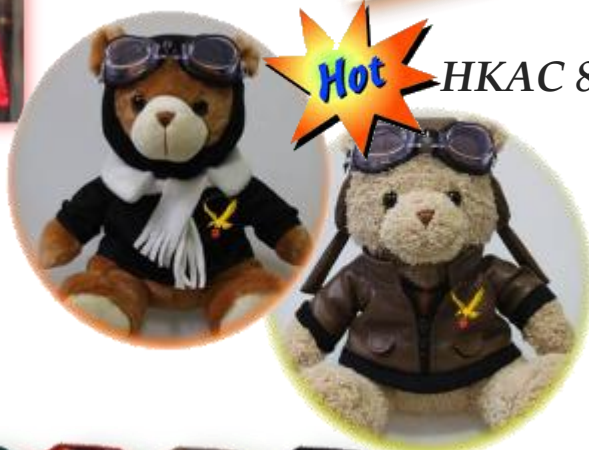
HKAC 8 inches Pilot Bear