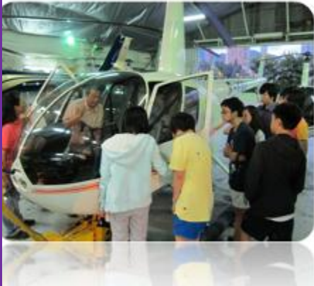
06 Aug 2011 Learn to Fly Stage 2